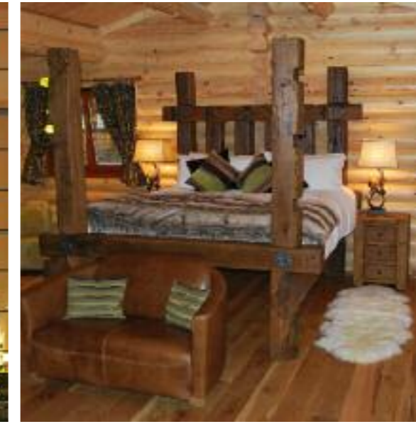
EYE KETTLEBY LAKES www.eyekettlebylakes.com