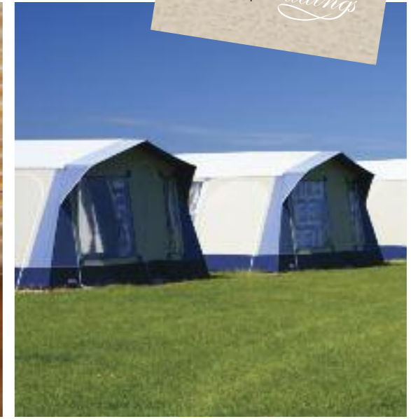
CAMPING / GLAMPING Please speak to your personal event planner for more details