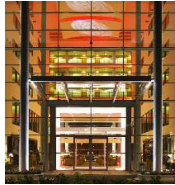
MARRIOTT LEICESTER www.marriott.co.uk